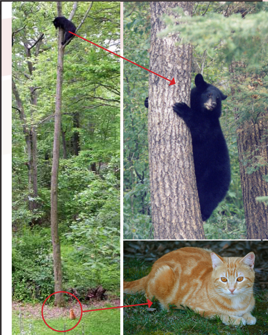
In the event of a pet treeing a bear, call your pet inside to a safe and secure area, allowing the bear time to retreat.