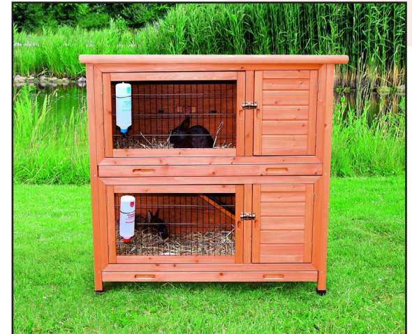
Sturdy wooden hutches are the most reliable form of protection for outdoor small animal enclosures, such as rabbits and guinea pigs. Securely attach a side of the cage to a permanent structure to prevent the hutch from falling over. Secure doors with locks, keep top covered and secured. In bear country, add an electric fence for further protection.

For More Resources on Electric Fencing: http://MyFWC.com/Media/1333878/ElectricFence.pdf